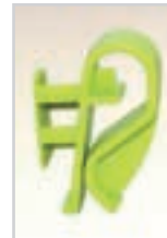
Cone Mount Clip